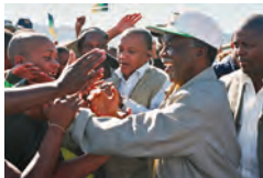
Big World Cinema/Big Sister/ITVS