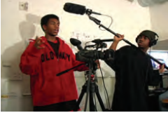
Bay Area Video Coalition