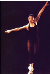
California Alliance for Arts Education