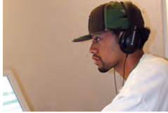
Bay Area Video Coalition