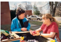
The Community Foundation of Western North Carolina/Forum of Regional Associations of Grantmakers