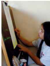
California Alliance for Arts Education