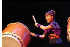
X2 Digital Photography/San Jose Taiko