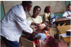
Rose N. Oronje/APHRC