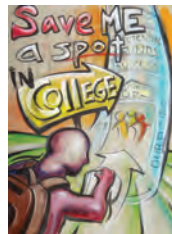
The Campaign for College Opportunity