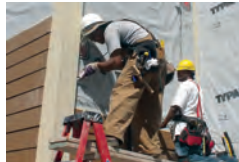
The Bridgespan Group/SF Mayor's Office of Communities of Opportunity