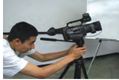
Bay Area Video Coalition