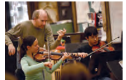
Classics for Kids Foundation