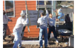
The Bridgespan Group/SF Mayor's Office of Communities of Opportunity