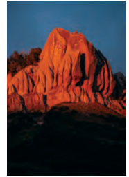
Jordan Beezley/Western Resource Advocates