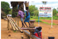
Revenue Watch Institute