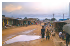
Revenue Watch Institute