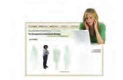
Laurence Penn/Dynamic Digital Media