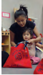
Silicon Valley Community Foundation