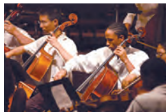
Young Musicians Program