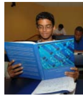
Connexions program, Rice University