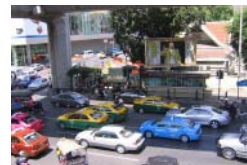
International Council on Clean Transportation