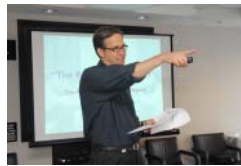
Communications Leadership Institute