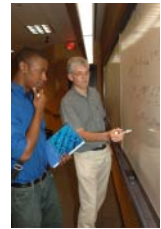
Connexions program, Rice University