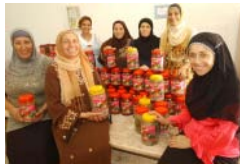
Efi Sharir / ITVS