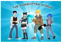
Coastline Community College