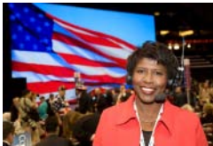
The NewsHour with Jim Lehrer / Greater Washington Educational Telecommunications Association