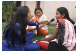
Gemma Quilt / Equal Access