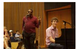
Scott Chernis / Stanford Jazz Workshop