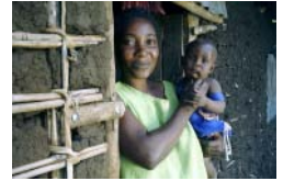
Ami Vitale / CARE