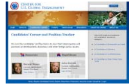
Center for U.S. Global Engagement