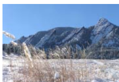
Jordan Beezley / Western Resource Advocates