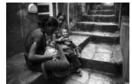
Raintree Films / ITVS