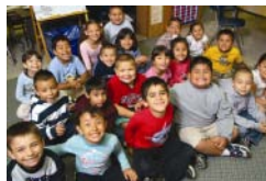
Hayward Unified School District