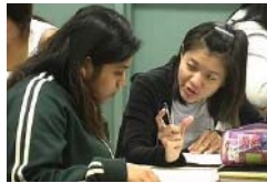
Carnegie Foundation for the Advancement of Teaching