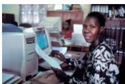
International Development Research Centre