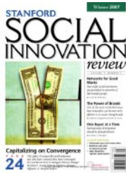
Stanford Social Innovation Review